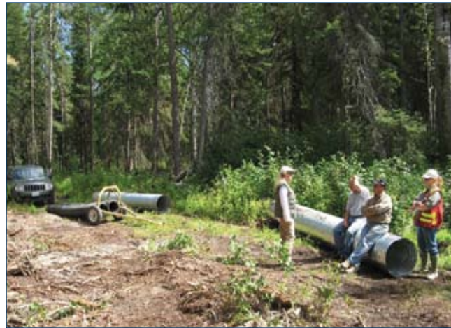
above: Lapointe Discovery - Tres-Or technical team proceeding with extracting 50 tonnes of kimberlite to process for macro-diamonds